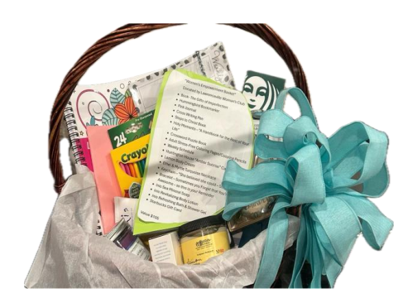
Sunshine Nicole Hallmark

We donated a basket for the "Women Empowerment Breakfast and it was valued at $105.